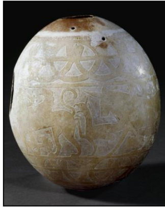
Ancient decorated Phoenician stone egg excavated from the tomb of Isis

Pagan festivities at this time have been included in Easter, such as Easter eggs, taken from Baltic Paganism and the Easter rabbit or hare, which recalls the sacred hares of the British tribes ( A History of Pagan Europe , p. 122).