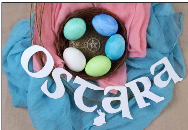
Neo-pagan Ishtar or Ostara eggs

God would never approve of using eggs to represent the resurrection of our Lord. As the Apostle Paul noted, it is the heathen cultures that have “exchanged the truth of God for the lie, and worshiped and served the creation rather than the Creator” (Rom. 1:25). As innocent as Easter eggs may seem to most people, they simply have no place as a religious symbol in true Christianity. Modern pagans understand this and continue to use eggs in their Ishtar celebrations.